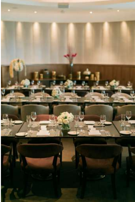
Matador Room at the Miami Beach EDITION